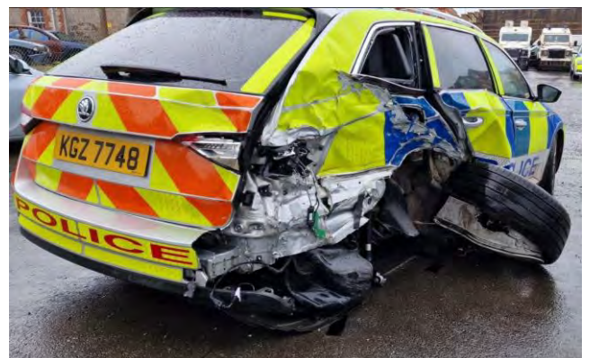
Examples of damaged Police Vehicles currently awaiting repair.