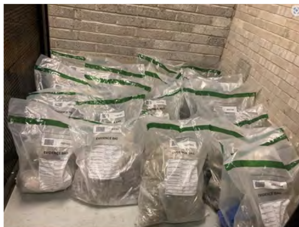
Suspected cannabis with estimated street value of £1.7 million