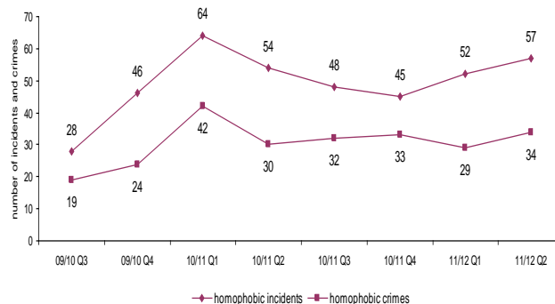
Figure 2 Homophobic incidents and crimes: quarterly totals over the two years to Sept 2011