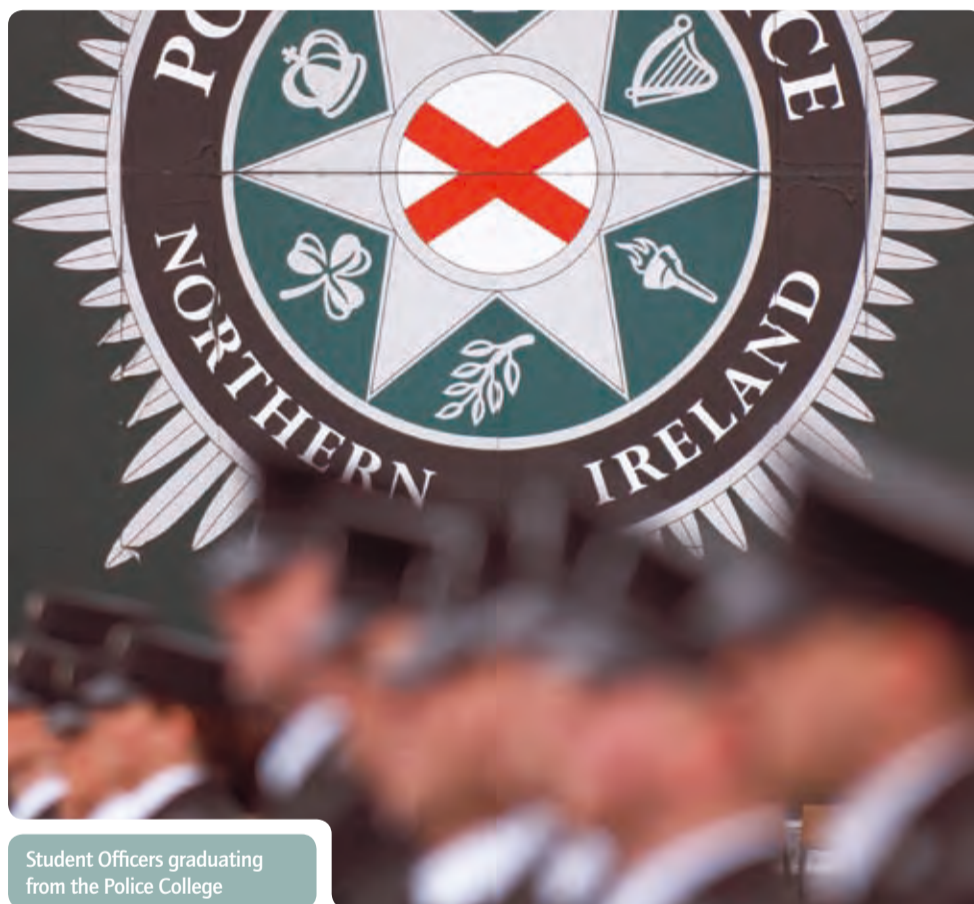
Student Officers graduating from the Police College

Student and trainer exchanges with our partners in An Garda Síochána, Jersey Police and The Ontario Police in Canada also continue, and we now have a reputation as world leaders in our field.