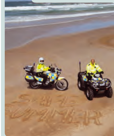
Police hit the beach at the launch of Operation Safe Summer

The aim was to address violent behaviour, threatening, aggressive and abusive drunken behaviour, indecent behaviour, on-street drinking, excessive noise, vandalism and dangerous and careless driving, throughout the district, focusing the areas' extensive and popular stretch of coastline.