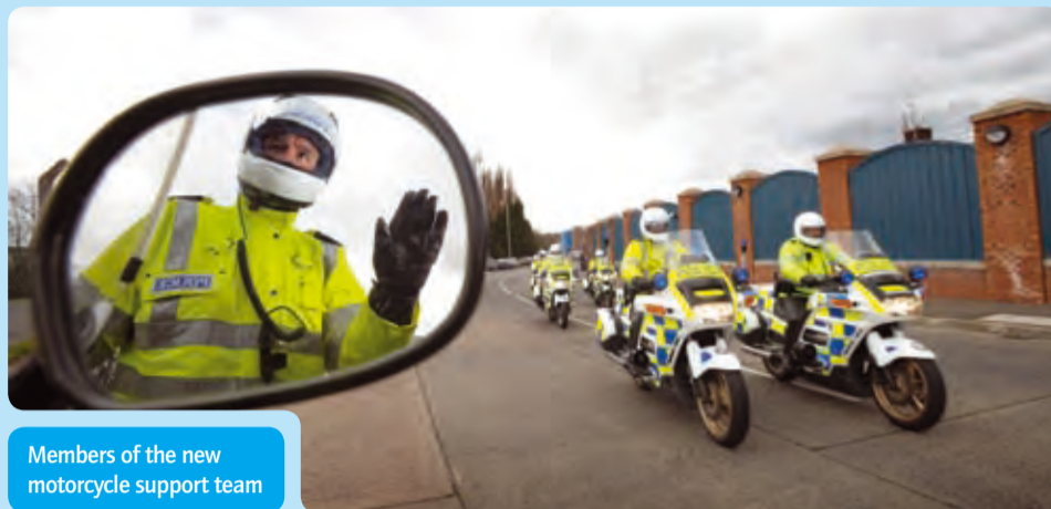
Members of the new motorcycle support team

Tragically, the number of motorcyclists killed on our roads has remained at an unacceptably high