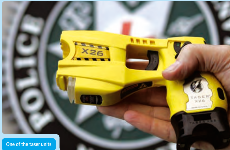
One of the taser units

The decision to pilot TASER® was taken following extensive consultation and research in relation to Human Rights and Equality considerations.