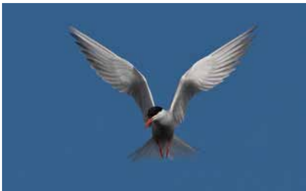
Common Tern