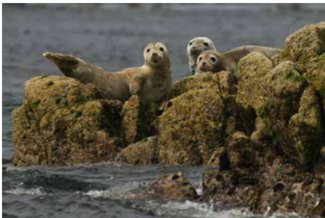
Grey Seals on the rocks by Geoff Campbell

These marine mammals are seen all around the coast of Northern Ireland, they come ashore or 'haul up' to rest and give birth.