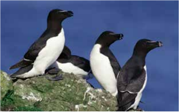
Razorbills by Laurie Campbell