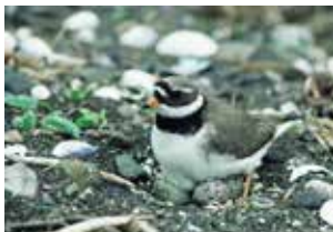
Ringed Plover Sitting on The Nest