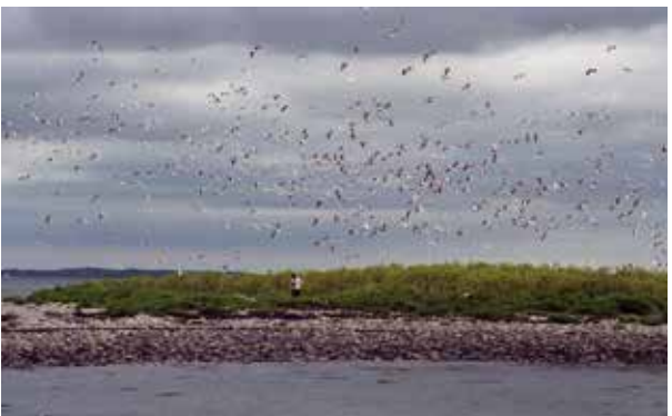
Flock Mobbing by Jon Lees

Northern Ireland’s wildlife is under constant stress from human activities, some areas are designated to allow wildlife to live in peace. When walking or landing your boat on isolated beaches and islands think wildlife! Between March and September birds will be nesting. Many birds nest on the ground at the top of beach or on cliff top ledges. Some birds, eg Terns, nest in groups or colonies these are clearly visible from a distance. These birds react by flocking violently when approached often mobbing the ‘predator’.