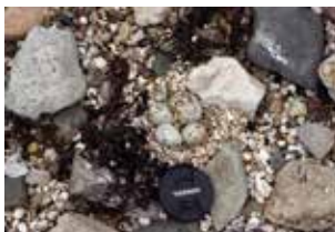
Ringed Plover Eggs by Jon Lees

Other birds, eg ringed plover, nest individually above the high tide line, these are difficult to spot and their eggs tend to be camouflaged! The adults try to lead you away from the nest by distraction behaviours.