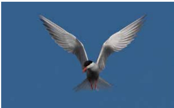
Common Tern