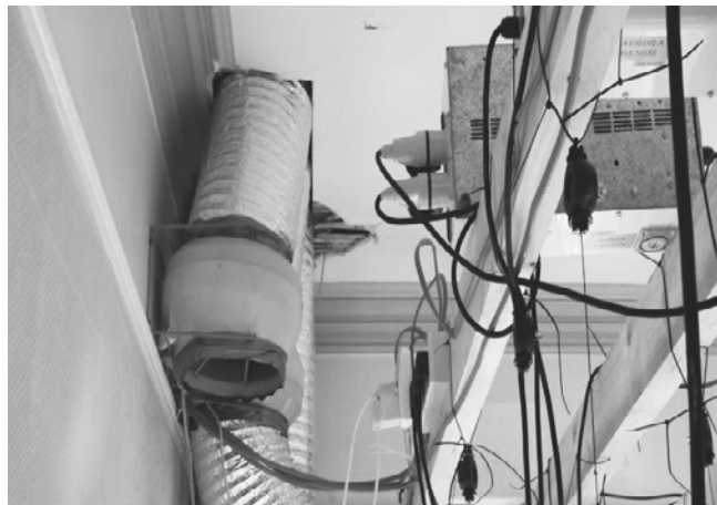
Property damage discovered at cannabis farm.