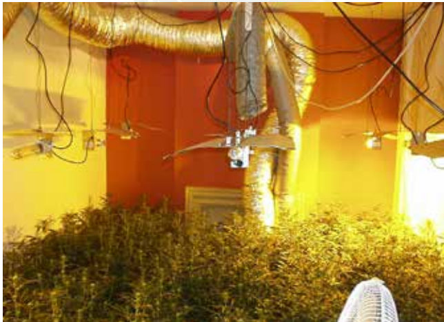
A cannabis farm.

The Police Service is concerned that organised crime gangs are doing just this.