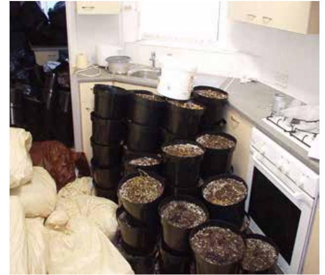
Waste products from a cannabis farm.